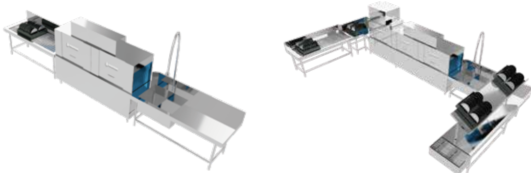
標準式運作圖 Standard Type Operation